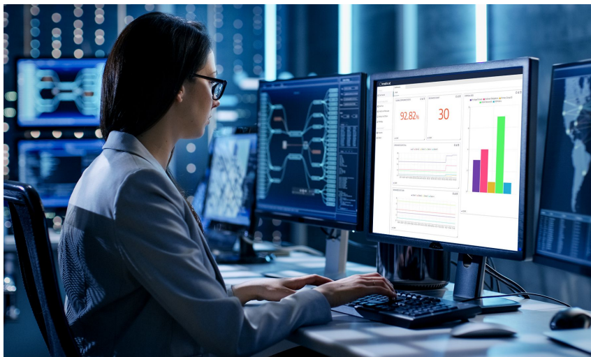
Use Tenable Identity Exposure to find and fix AD weaknesses before attacks happen.

The Tenable Professional Services team and our global network of certified partners provide advice on product optimization and industry best practices. Their experience has been gained from years of hands-on experience with thousands of customers worldwide.