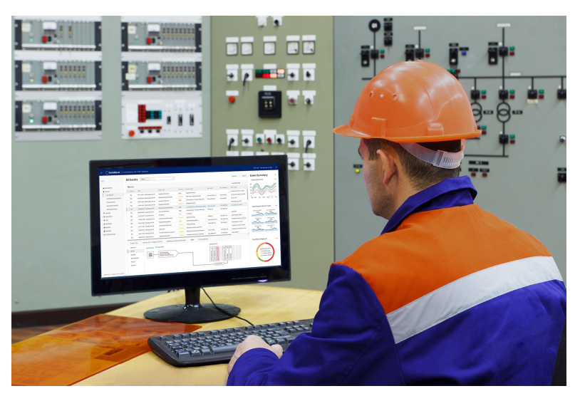
Get the security you need and reduce the risks you don't with Tenable OT Security

A Tenable OT Security Quick Start from Tenable Professional Services helps you install, configure and start using Tenable OT Security most effectively while following industry best practices. By strategically implementing Tenable OT Security, we can ensure that your organization can safely scan Industrial Control System (ICS) networks and converged OT and IT environments to identify assets and reduce risk across your entire attack surface.